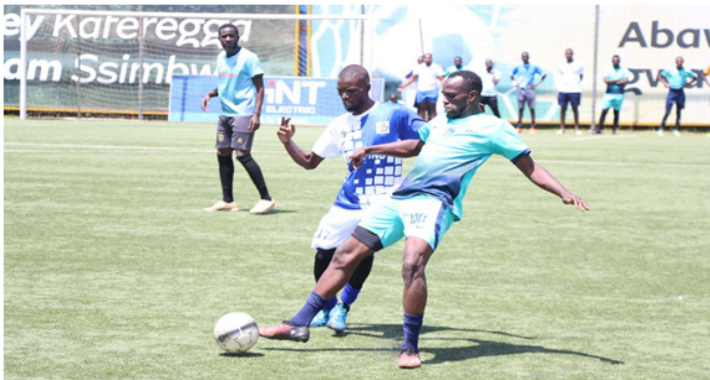
Inset: A game ongoing during the tournament