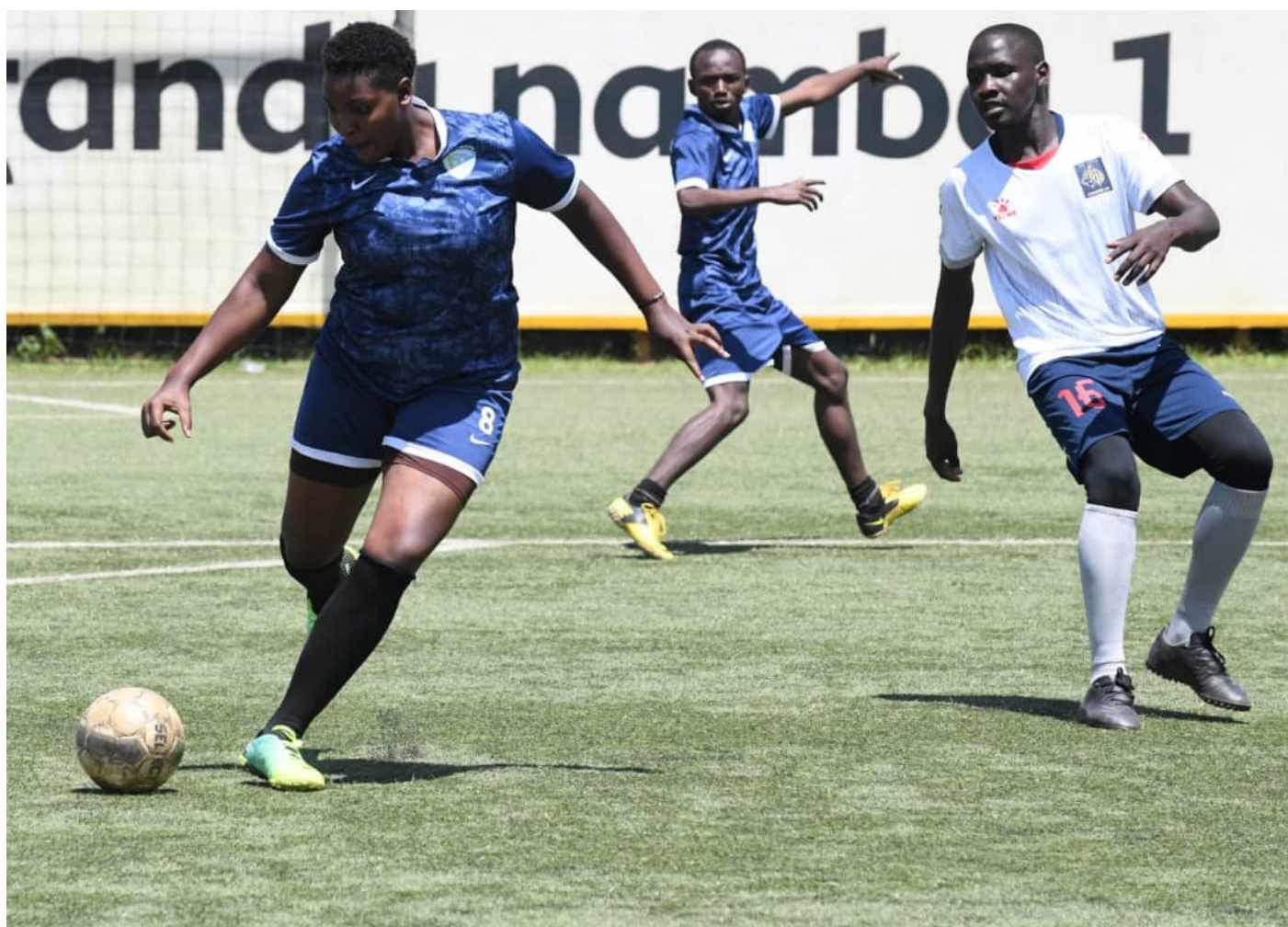
Inset: A female advocate from Barapwo FC enjoys herself during the competitions