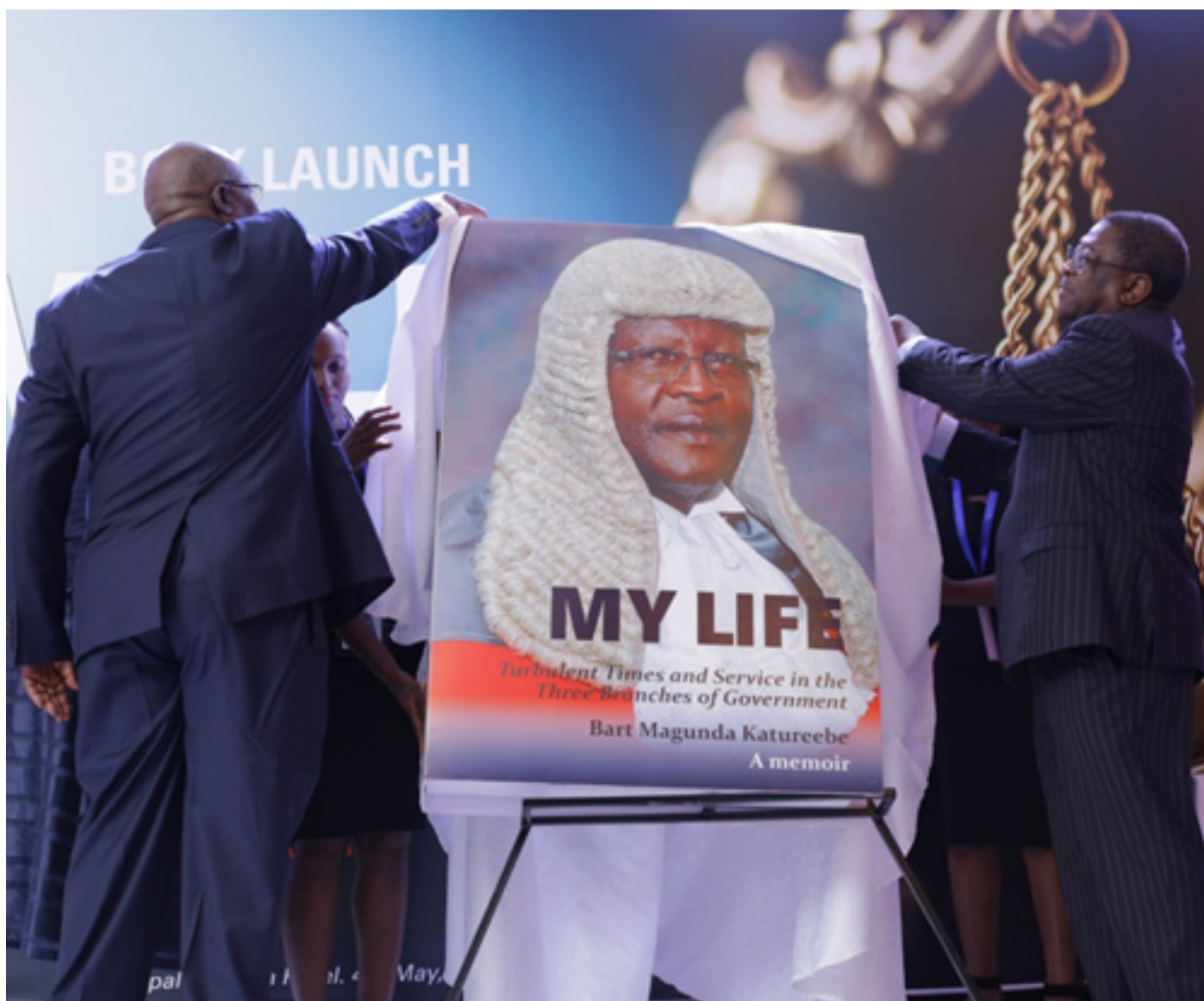
The book is officially launched

The event was presided over by Mr Steven Wako the former Kenyan Attorney General and Senator. The former Chief Justice emphasized the role of transparency and accountability as well as the important role collaboration between different arms of government.