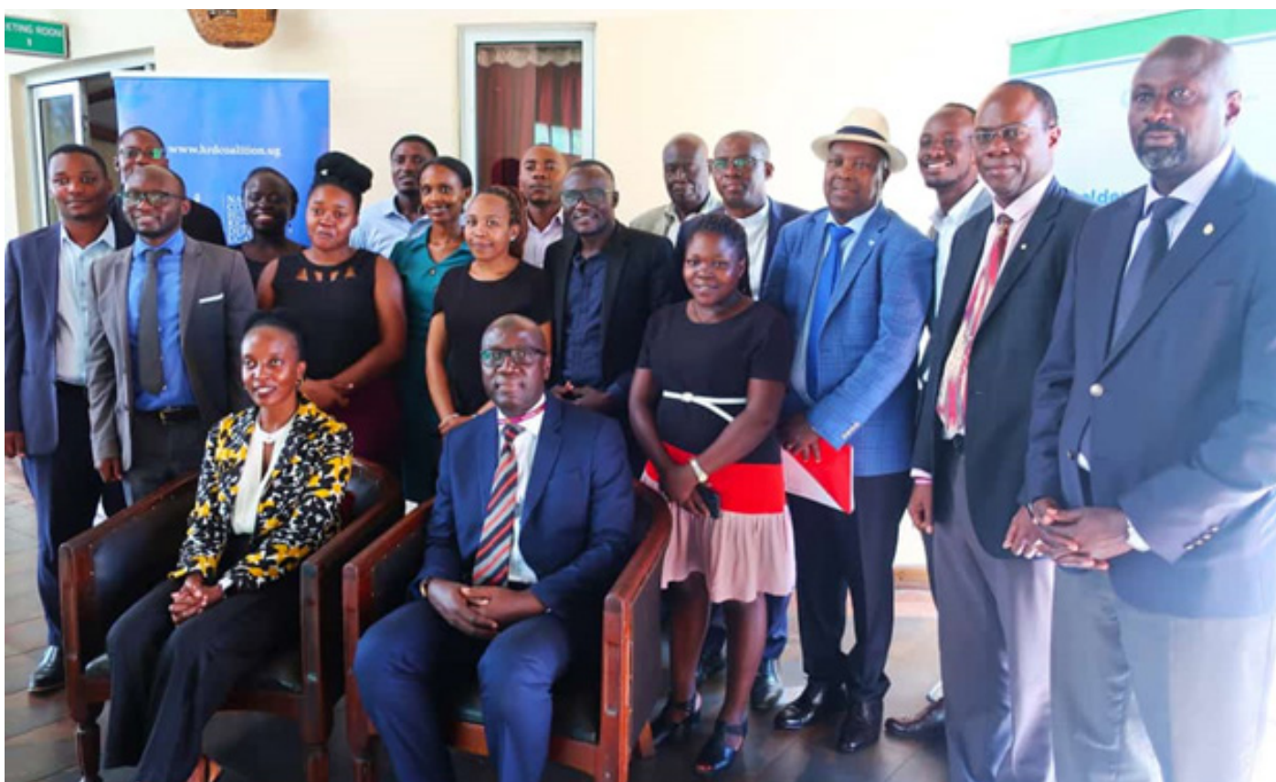
Inset: Group Photo at the Stakeholder Engagement on the Uganda Civil Society Alternative Report on the Implementation of the ICCPR in Uganda