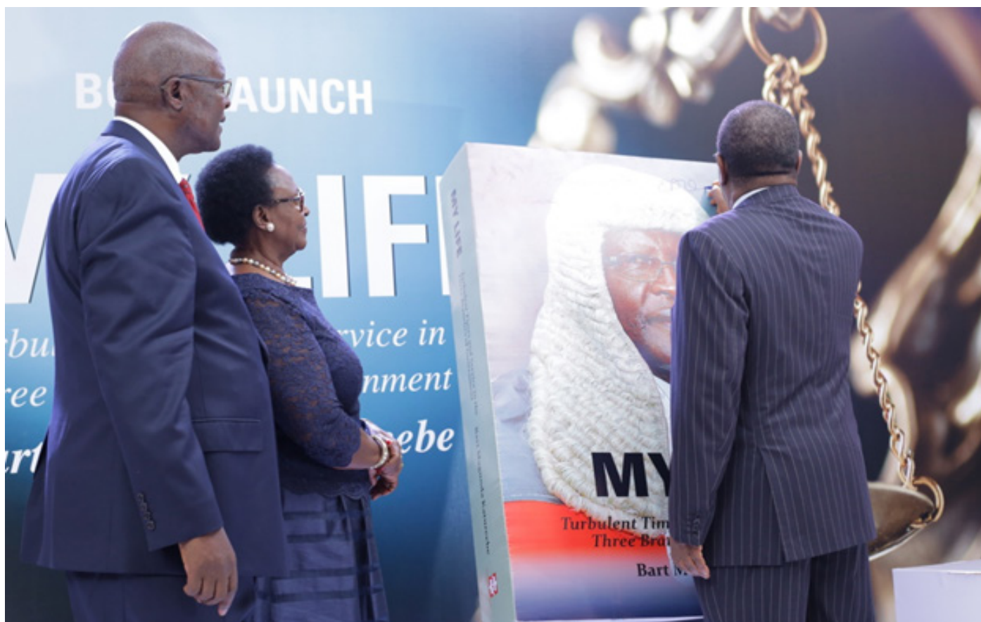
The Former Chief Justice joined by his wife look on as the book dummy is signed at the launch.